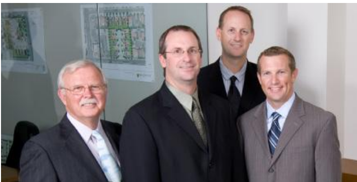
Brandywine Homes Management Team