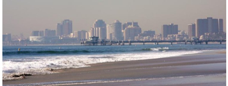
Belmont Pier with the Long Beach skyline