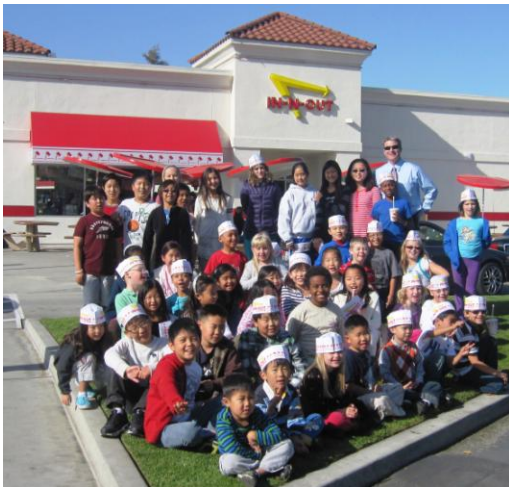
Student fundraising winners at Joe A. Gonsalves Elementary School received a limo ride and lunch at In-N-Out Burger in La Mirada with the Principal.