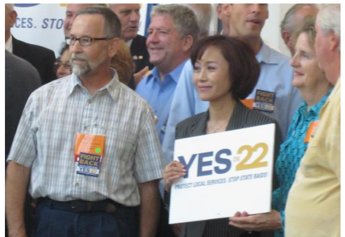
League officials urge a "Yes" vote on Prop 22