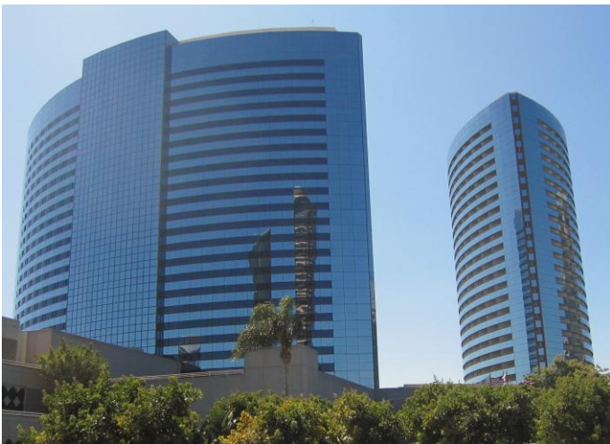
San Diego's Marriott Hotel