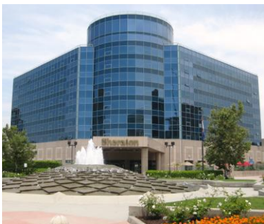
Sheraton Hotel Cerritos, California