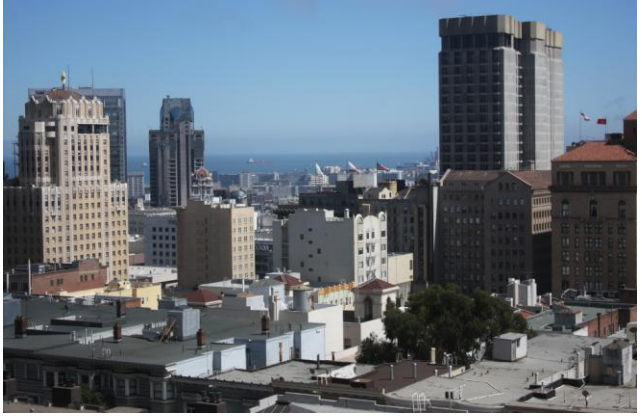
View of S.F. from our Huntington Hotel room window.

Experienced in conducting personnel – and internal affairs investigations.